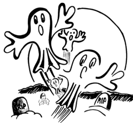
Scared of ghosts? The supernatural past of historic York is explored M8