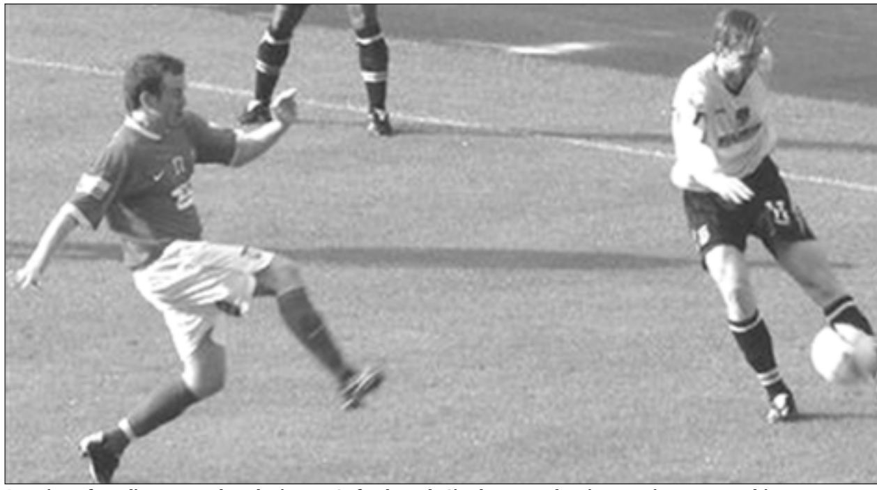
Despite a few slip ups, such as losing to Oxford, York City have made an impressive start to this season