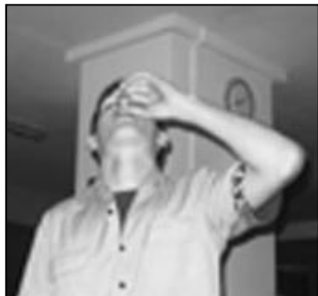
Dan bravely knocks it back. Chilli. Blunder.

The only reason to visit this rather expensive chain of bars is the shots they serve. For a pound you can pick the flavoured vodka of your choice, complete with lurid synthetic colours.